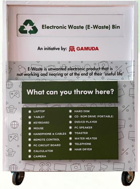
E-waste bin located at B5 car park area of Menara Gamuda

With this certification, we commit to avoid pollution, as we can revise utilizing and repurposing our resources in our efforts to reduce waste.