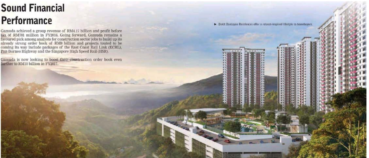
► Bukit Bantayan Residences offer a retreat-inspired lifestyle to homebuyers.

Gamuda is now looking to boost their construction order book even further to RM10 billion in FY2017.