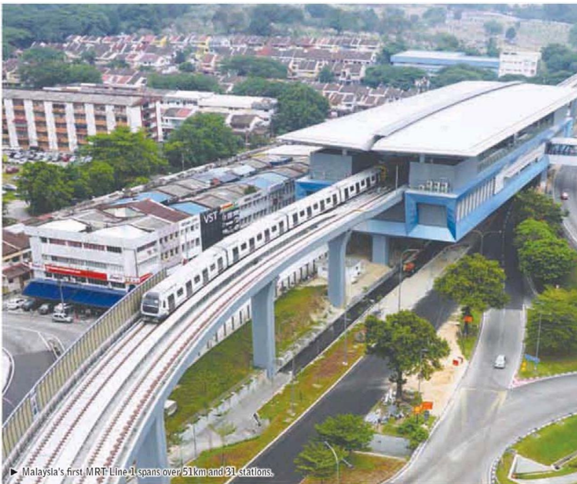
► Malaysia's first MRT Line 1 spans over 51km and 31 stations.